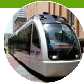
LRT in Houston, Texas

Join Light Rail Links at www.lightrailinks.com to demonstrate your support for LRT.