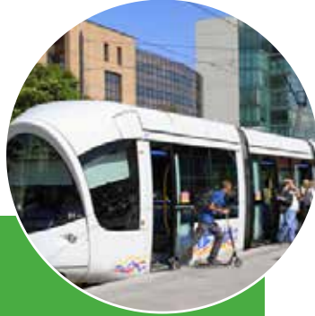
LRT in Lyon, France