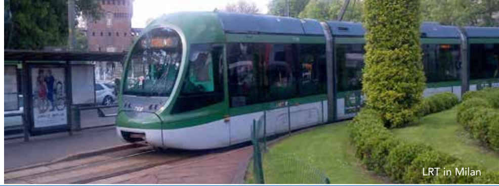
LRT in Milan