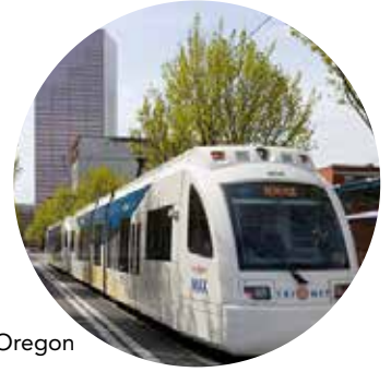
LRT in Portland, Oregon