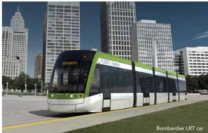
Bombardier LRT car

The Light Rail Links Community Coalition formed as a result of the growing movement of like-minded individuals and groups advocating for LRT south of the Fraser. Our coalition is made up of community supporters that represent a variety of interests.