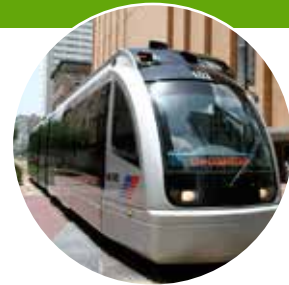
LRT in Houston, Texas

Join Light Rail Links at www.lightrailinks.com to demonstrate your support for LRT.