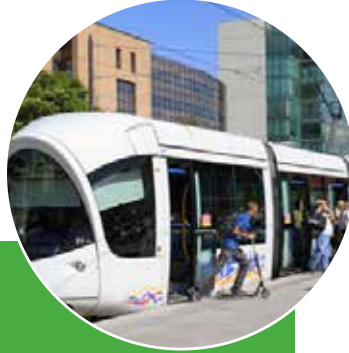
LRT in Lyon, France

"That's where the region is changing the most [Surrey] and that's where we need transit...It shouldn't be put off...If we put rapid transit in there, it would put a big impact on the development community on where it wants to go."